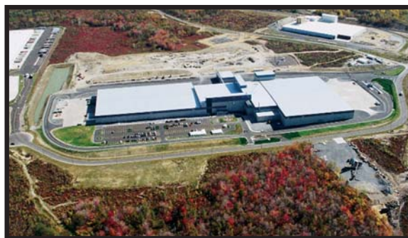
Aerial view of Archer Daniels Midland's 500,000-square-foot cocoa processing plant in Humboldt Industrial Park, Luzerne County.

Hazleton's industrial/economic development corporation, CAN DO Inc., helped ADM in obtaining a $4.6 million funding offer from the Department of Community and Economic Development that included a $925,000 opportunity grant, $2.5 million in