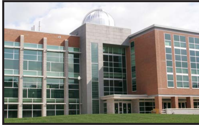
East Stroudsburg University's new $41 million building recently opened in Monroe County.