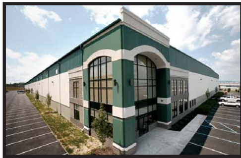
254,200-square-foot speculative industrial building is home to Emery-Waterhouse Co. and Quiet Flex Manufacturing.

Two companies have recently signed leases at Mericle Commercial Real Estate's CenterPoint Commerce & Trade Park East in Jenkins Township, Luzerne County. Both tenants occupy a 254,200-square-foot multi-tenant building at 275-285 CenterPoint Boulevard.